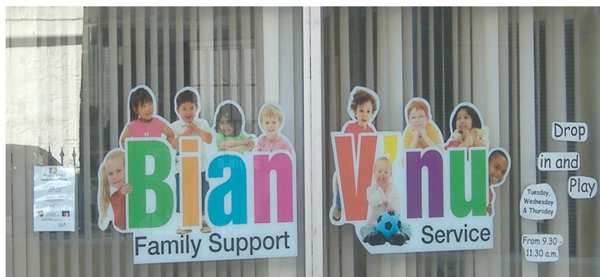
Figure 3 – Sign in Guernesiais at a family support centre

In Guernsey the appointment of a Language Officer provided a contact point for language-related enquiries. This led to increased inclusion of some Guernesiais in the branding of local products and services, and to requests from local businesses and organisations for translations of slogans: eg bus timetables, notices at an agricultural show, signs at sports centres and a family centre (see Figure 3).