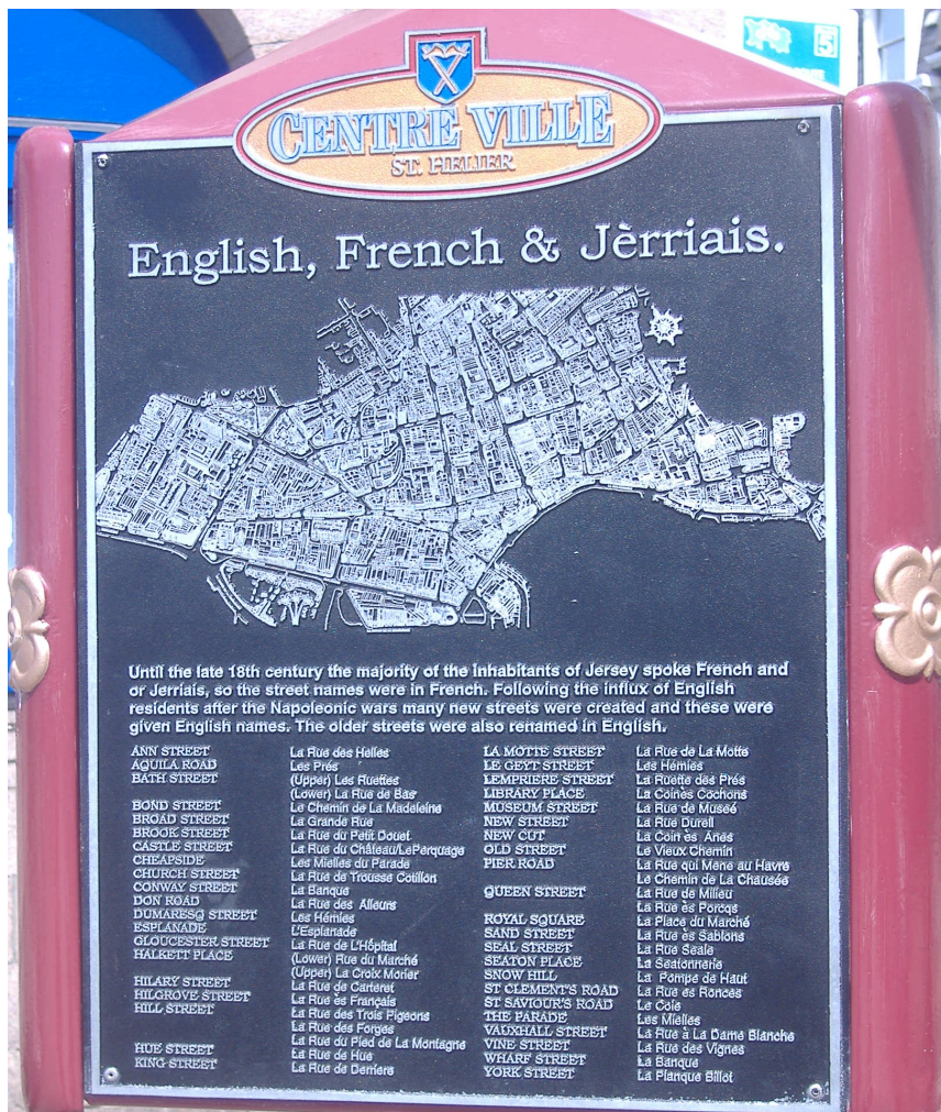
Figure 2 – signage in St Helier showing place name variants

In the Channel Islands the study of 'language in the public space' is complicated by the use of Standard French on street signs, as the written form that traditionally represented insular Norman. Many street names are written in both English and French, but are not necessarily direct translations: eg Quay Street = La Rue du Pileri ('Stocks Street') (see Figure 2). The reclamation of place-names is a frequent focus of revitalisation efforts, eg in Ireland and Australia. L'Office du Jèrriais has made a concerted effort to increase the amount of Jèrriais in public signage, either bilingual Jèrriais-English or trilingual with French, eg recycling bins with Jèrriais on one side and English on the other. Smaller but highly visible components of the print environment are included in this drive: eg the latest Jersey banknotes have the denominations written in Jèrriais as well as English and French, albeit in smaller print. L'Office du Jèrriais reports that stamps using Jèrriais will appear by the end of 2011.